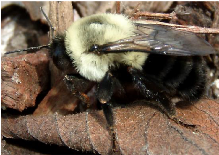
Early blooming species of woodland wildflowers, and spring blooming trees and shrubs provide an important early nectar source for the common eastern bumblebee, improving the yearlong success of its colony.