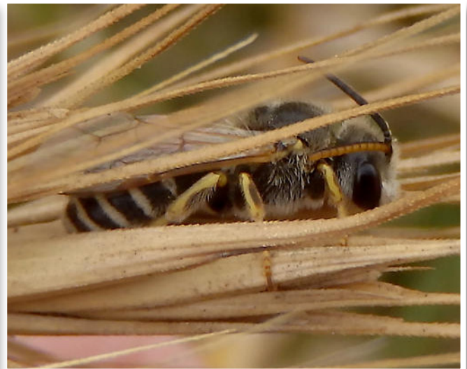
This native sweat bee species benefits from habitat that native woodlands provide.