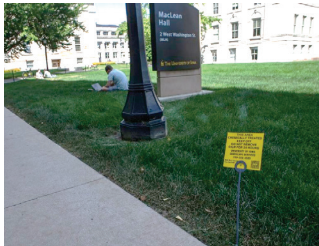
FIGURE 1. (Top) Students sitting on grass during 2019 Labor Day weekend regardless of yellow signs warning of recently chemically treated lawn. (Bottom) Students walking on the Pentacrest in 1990 near lawn with yellow sign warning students to keep off.

Over the past several years and in response to these more high profile application events, both the Office of Sustainability and the Environment (OSE) and the Center for Health Effects of Environmental Contaminants (CHEEC) have received numerous inquiries about risks and the extent of pesticide use at the University of Iowa. Motivated by these inquiries and in response, both offices decided to sponsor an interdisciplinary internship starting in the Fall of 2019 to collect data related to pesticide use on campus.