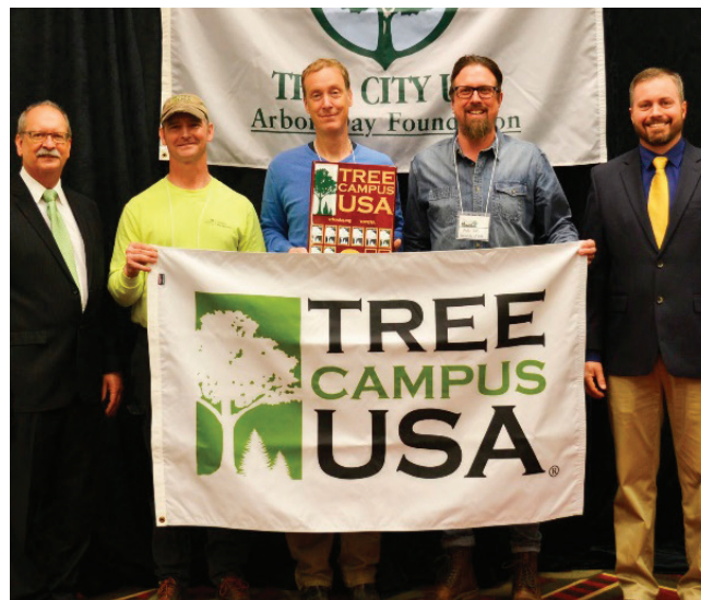
FIGURE 2. UI Landscaping Services Tree Crew receiving their 9th Tree Campus USA award in at the 28th Annual Community Forest Awards Luncheon in Des Moines in 2018.

UI Athletic Grounds oversees athletic grounds under the University of Iowa Athletics Department.