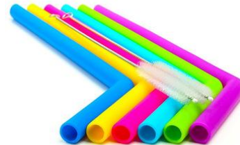
Silicone Smoothie straws ($9.99 for 8)