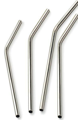
Metal straws for day to day use ($4.98 for 6)